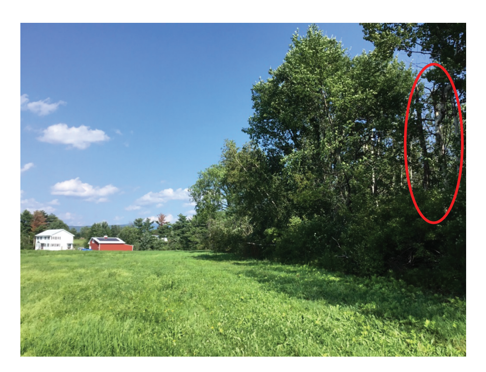
Photo 2. Typical tree hedge row looking east towards the Study Area edge, VELCO New Haven Operation Facility, August 9, 2018, Stantec. Note potential suitable snag outline in red.