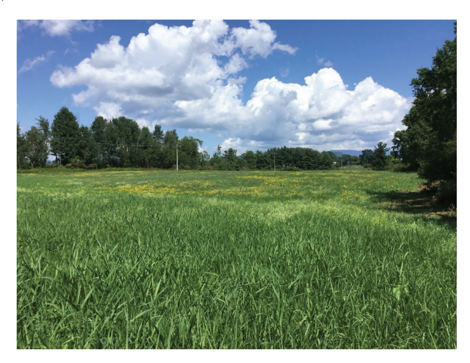
Photo 5. Mowed field looking northeast, photo taken adjacent to wet meadow NH-203, VELCO New Haven Operation Facility, August 9, 2018.