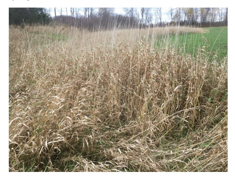
Photo 6. Wetland NH-203, VELCO New Haven Operation Facility, November 1, 2017.