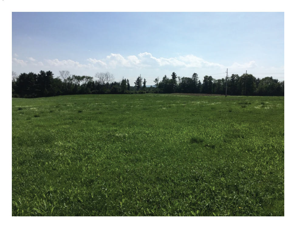
Photo 1. Representative mowed field, looking south from Vermont Rt. 17, VELCO New Haven Operation Facility, August 9, 2018, Stantec.