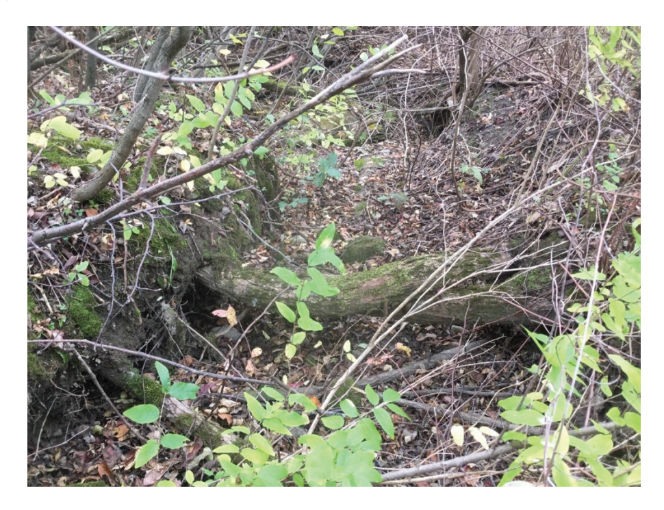
Photo 7. Ephemeral stream NH-204, VELCO New Haven Operation Facility, November 1, 2017.