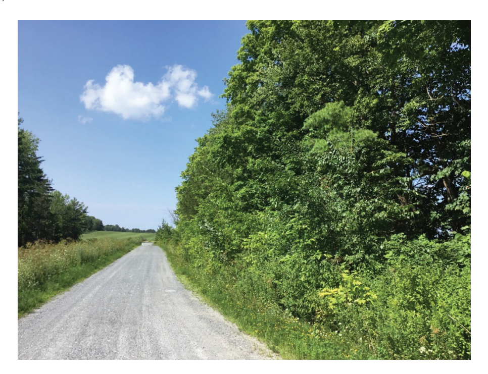
Photo 3. Access road to Study Area and adjacent substation from Rt. 17, VELCO New Haven Operation Facility, August 9, 2018, Stantec.