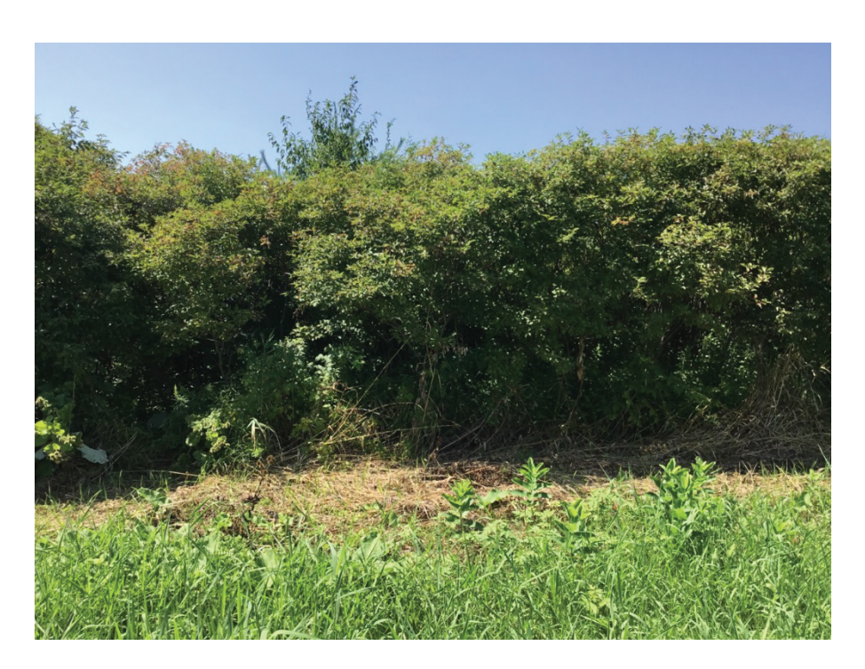
Photo 4. Scrub hedge separating existing laydown yard from mowed field, looking west, VELCO New Haven Operation Facility, August 9, 2018.