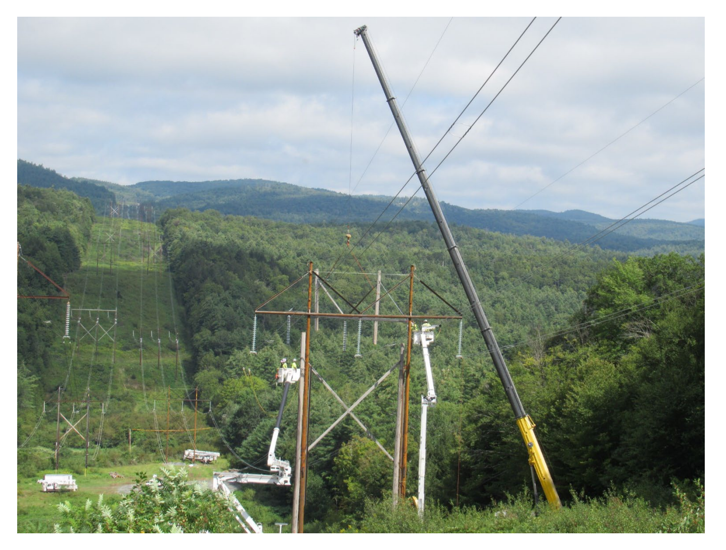
340 line str. 142